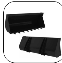
One Piece Bucket