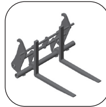
Forks Mounted on Quick Coupler